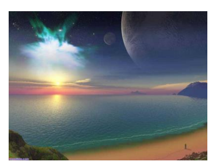
A wonderful, beautiful future awaits you

As such, we also will become replicas of God Himself – divine beings of the God Family.