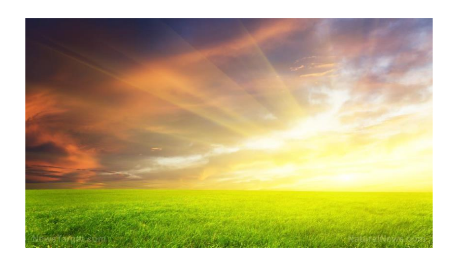
v1.0 Assembled by C White

"As for me, I will behold Thy face in righteousness: I shall be satisfied, when I awake [in the resurrection], with Thy likeness" (Ps 17:15. see too Job 14:14-15; IJohn 3:2)