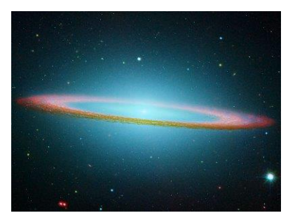
The glory of the Sombrero galaxy taken with an infrared camera

means a thing of beauty and magnificence, fame and honour as we have seen. As such that which is glorious deserves praise and rejoicing in. Similarly, in the Hebrew it means beauty, comeliness, honour, majesty, splendour, rich; while the Greek has the meaning of praiseworthy, dignity, honour, worship.